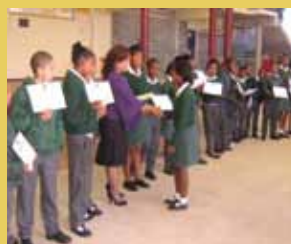
Students receive certificates for completing sexuality education.

Because HIV/AIDS crosses all boundaries and all social strata, our factual, Bible-based sexuality education program was taught in rural and urban areas of Cape Town, in a wide range of churches – including Anglican, Apostolic, Assembly of God, Baptist, Lutheran, Methodist, and evangelical — and in public schools, a juvenile detention center, a children's home, and school- and church-run summer camps.