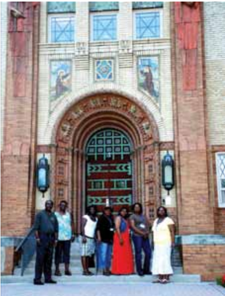
Historic Howard University School of Divinity was the site for the National Black Religious Summit on Sexuality.

Our pioneering and innovative multicultural program has a dual mission: to increase diversity in the reproductive rights movement and to provide comprehensive sexuality education within the African American and Latino communities. Its achievements during the year ranged from educating hundreds of youth and adults in Black churches to informing members of the Congressional Black Caucus of the need to advance sexuality education and reproductive health services in African American communities. In Latino faith communities in New York, Wisconsin, and New Mexico, we convened summits of religious and community leaders and adults and youth on sexuality issues during Hispanic Heritage month. Workshops to train clergy and youth-serving professionals in providing sexuality education were held in New York and Wisconsin.