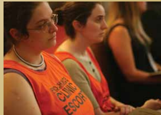
Clinic defense volunteers found solace in recalling Dr. Tiller’s dedication to women’s lives.